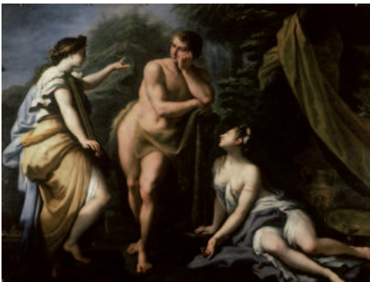
The Choice of Hercules by Paolo de' Matteis (1711)

Now find this painting in the same gallery: