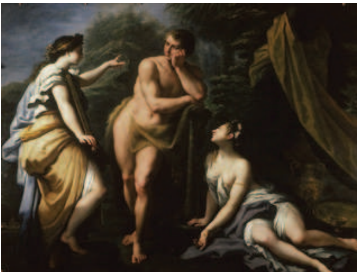
The Choice of Hercules by Paolo de' Matteis (1711)

This painting shows Hercules going out into the world to seek his fortune.