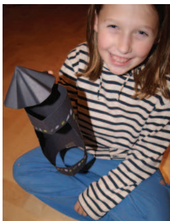
Children visiting the Ashmolean made their own versions of the Guy Fawkes lantern.