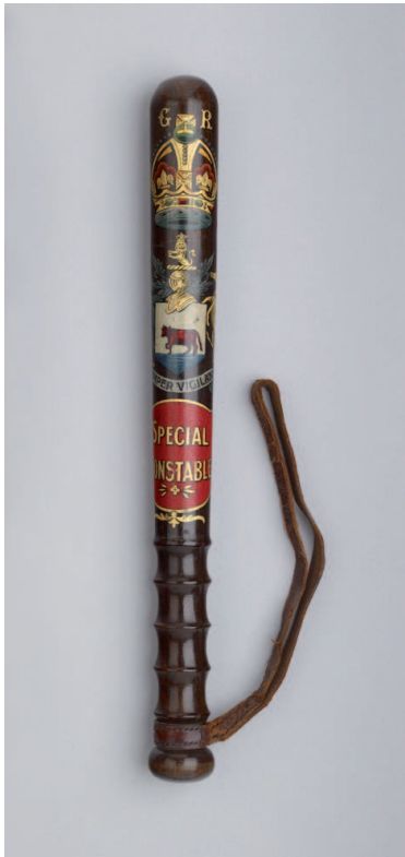
Policeman's truncheon of an Oxford town policeman. Watch out - it's upside down in the case!

Time yourself: you have 30 seconds to find out what ANIMAL they have in common.