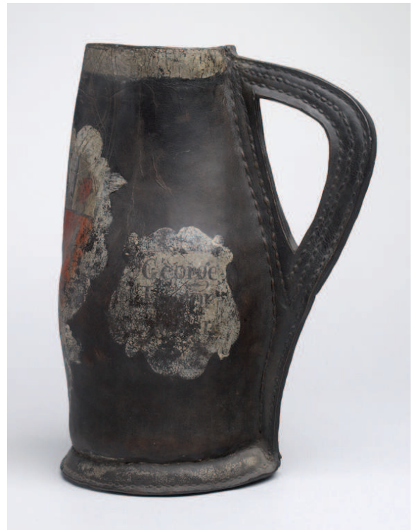
Blackjack jug, made of leather and used for drinking beer or ale.