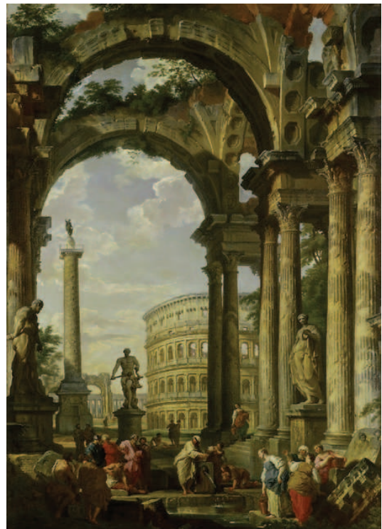
Roman Capriccio, Gallery 49

Panini painted little after 1760 and died in Rome on 21 October 1765.