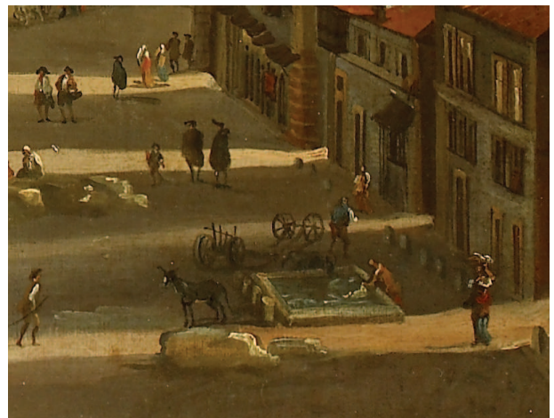
This detail shows a woman washing clothes in the Piazza del Popolo in the afternoon shade.

The challenge is for teachers to use the painting to develop culturally enriching, relevant and practical learning opportunities across the curriculum.