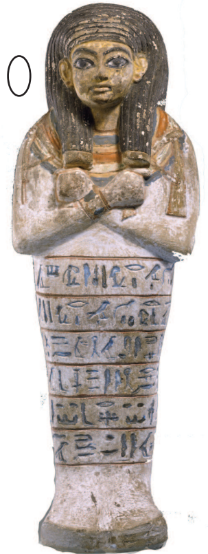
Shawabtis like this one are magical servants. Rich Ancient Egyptians would be buried with lots of them so they could take it easy in the afterlife!