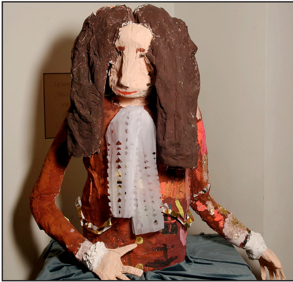
Papier mache bust of Elias Ashmole