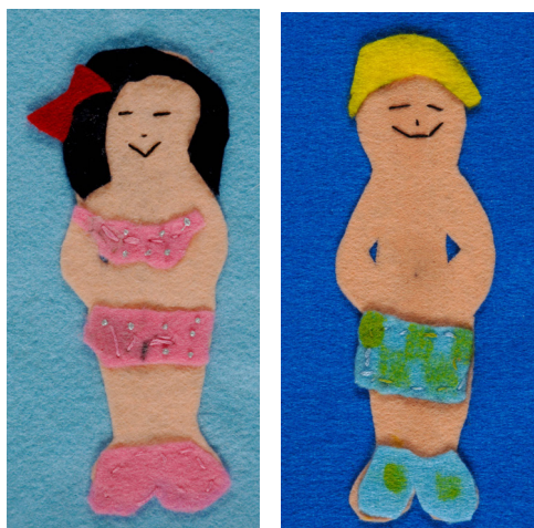
Swimwear designs inspired by Sickert's 'Brighton Pierrots.'