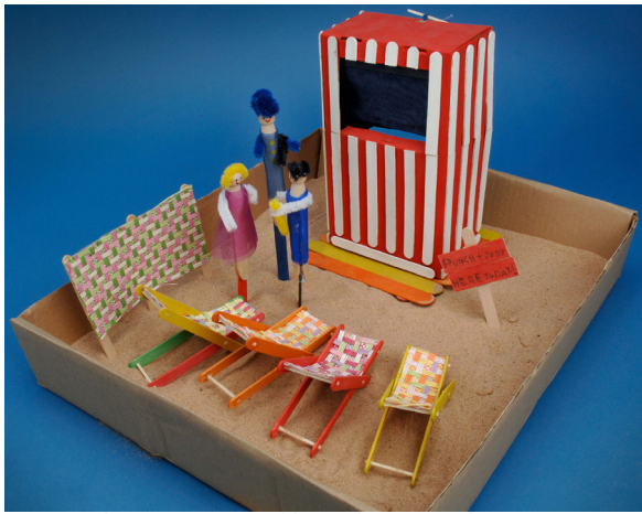
3D seaside scene inspired by Sickert's 'Brighton Pierrots.'